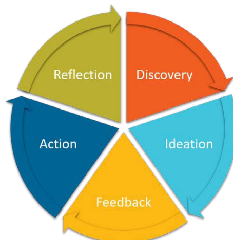
Figure 2: The Cycle of Engagement